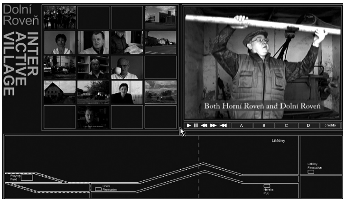
Figure 1: The Interactive Village interface enables the user to select 'stories' by location or image.

& listen in Observational mode; access the Didactic anthropologist's commentary explaining, guiding and informing; or to "take issue" by accessing a particular point of view on a subject or issue e.g. threat to rural transport issues — viability of train service, village communication. The Interactive Village Journalistic mode re-models Henley's concept of journalistic away from the film director/journalist to the user becoming the journalist: piecing together programme material into a narrative structure that reflects his/her own interests.